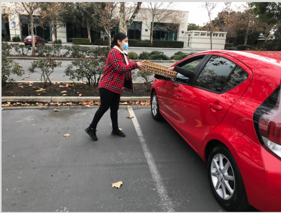
Staff safely handing gifts to CASAs to be delivered to their youth

Legos, books and so much more gifted by St. Matthews Episcopal Day School. Thank you to all those who made this a success by bringing some much needed joy to so many youth this season.