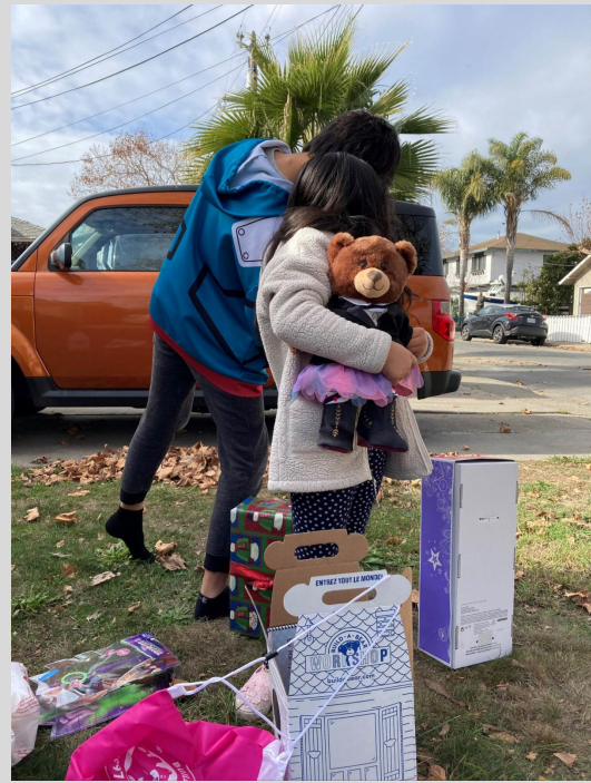
Getting hugs from a new friend this holiday season!