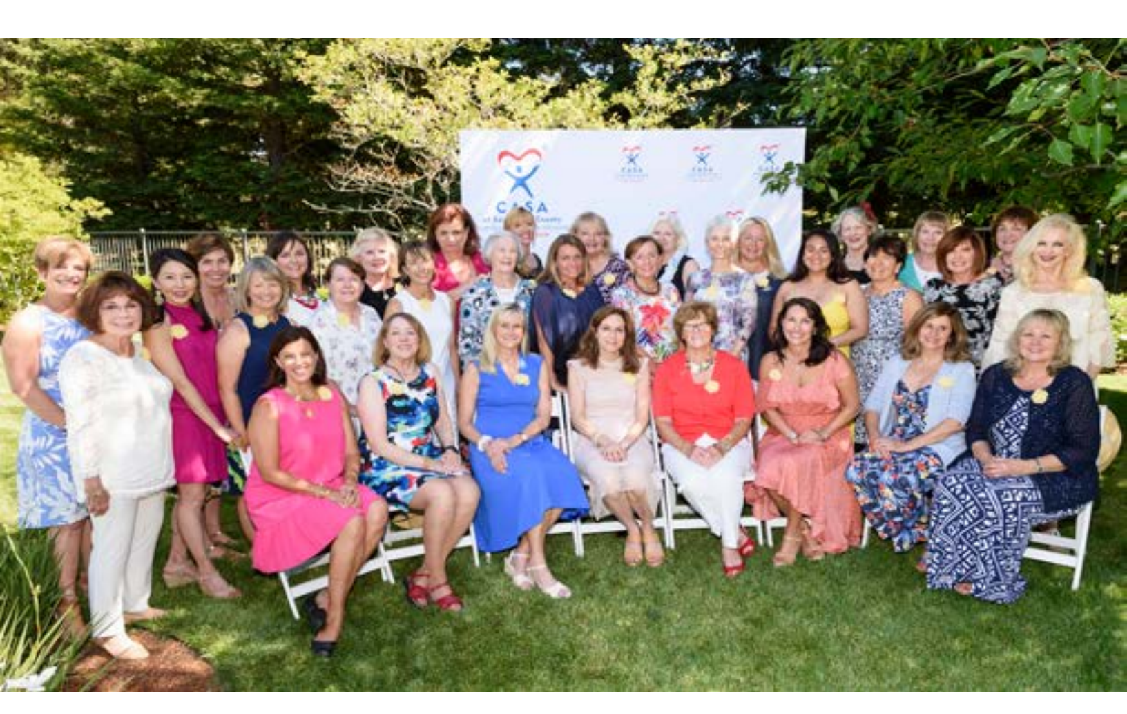
The CASA Auxiliary includes dedicated women who donate their talents and time to organize and support the annual Garden Party fundraiser.

CASA's premier fundraising event is hosted annually by the Auxiliary for CASA of San Mateo County and attended by over 300 guests. The event is an afternoon of music, hors d'oeuvres, wine and beer tasting while raising funds via a raffle, and a silent and live auction, all in a spectacular garden setting.