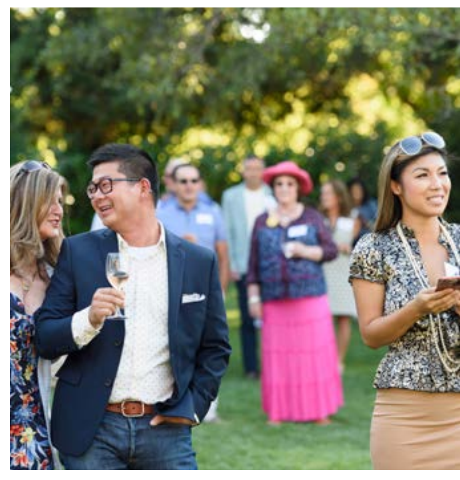
Over 300 guests enjoyed the afternoon, accompanied by great music and delicious food and drinks. Bidding was fierce and friendly as the auctioneer energized the crowd, with winners receiving highly sought after items.