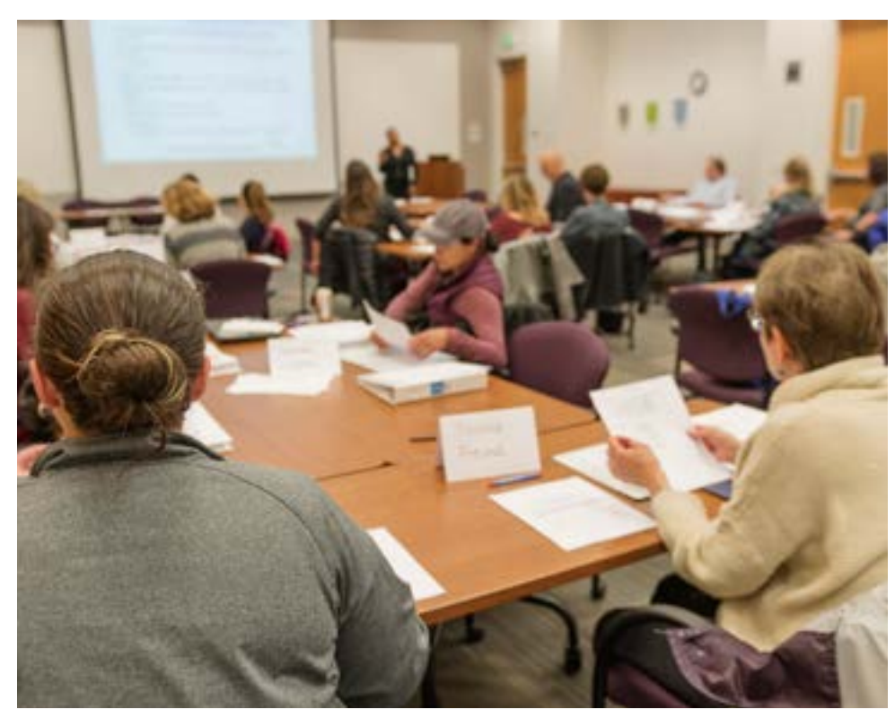
With over 50% Hispanic/Latino foster youth in our community, we ensure our Spanish-speaking volunteers are trained in their native language to better connect with their Spanish-speaking foster youth to build a trusting relationship, and be able to best advocate on their behalf.

Volunteers attend 30 hours of training in the child welfare system - and unique to our program - the probation system, so they can advocate for their CASA foster youth. Upon completion, they are sworn in as an Officer of the Court. In addition, each volunteer completes 12 hours of continued education throughout the year.